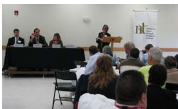
A panel discusses natural gas issues at the 2009 summit

May 18, 8 a.m.-1:30 p.m., Wysox Volunteer Fire Hall