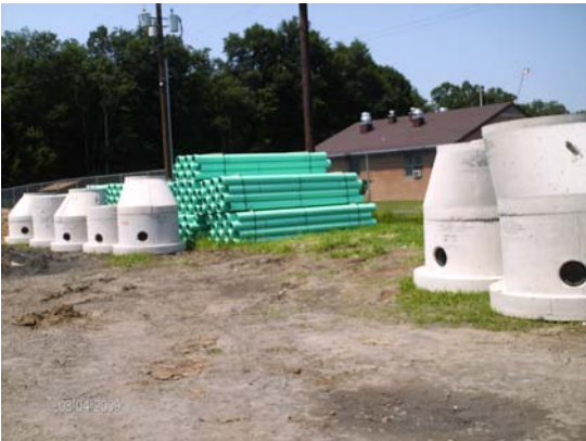
Construction begins on the Factoryville Borough/Clinton Township Joint Municipal Authority wastewater improvement project.

The Appalachian Regional Commission (ARC) is a federal-state partnership that supports economic development in the Appalachian Region.