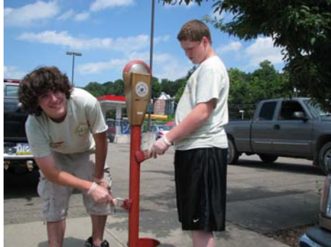
Summer employment participants paint parking meters in downtown Dushore.

147 participants gained work experience throughout the region