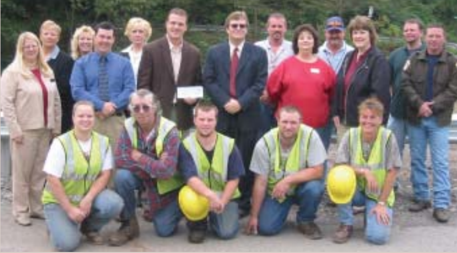
Members of the original Wyoming County crew gather with others involved in the project to receive a donation from Wal-Mart Stores, Inc.

The project required the hiring of 9 crews and 126 temporary employees including a flood program manager, fiscal assistant and on-site crew leaders who worked from October 2006 through April 2007. Since the funding provided by the U.S. Department of Labor, the ultimate goal was to provide unemployed individuals with an opportunity for work, training, and hopefully full-time employment. During the hiring process, priority was placed on dislocated workers from the flooding of June 2006, dislocated workers, or long-term unemployed individuals. Each crew member earned $10.00 per hour and crew leaders earned $12.00 per hour and all received necessary safety and clothing allowances.