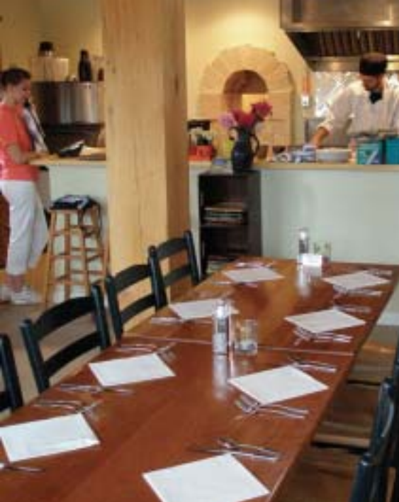
The Summerhouse Grill

farms. The partnership was awarded a CAFA permit to expand their agriculture opportunities from just dairy to pork production as well. The Partnership is responsible for the production of over 41,000 sows per year. The economic impact of the project benefits the local economy with the creation of 15 to 20 additional jobs. The Commonwealth's First Industry Fund was used to help with the financing of this large project.