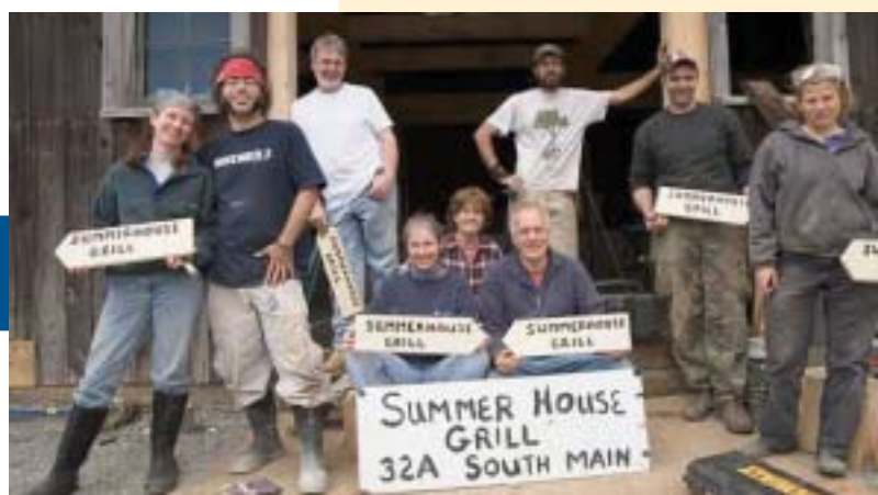
A renovation workbee at the Summerhouse Grill.